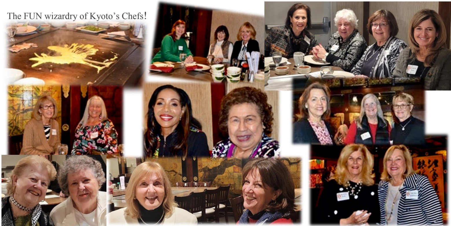
The FUN wizardry of Kyoto's Chefs!