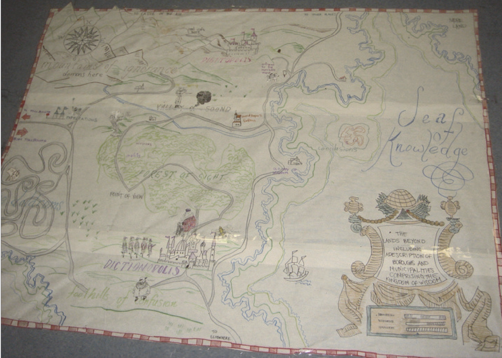
Wednesday, September 4, 2013